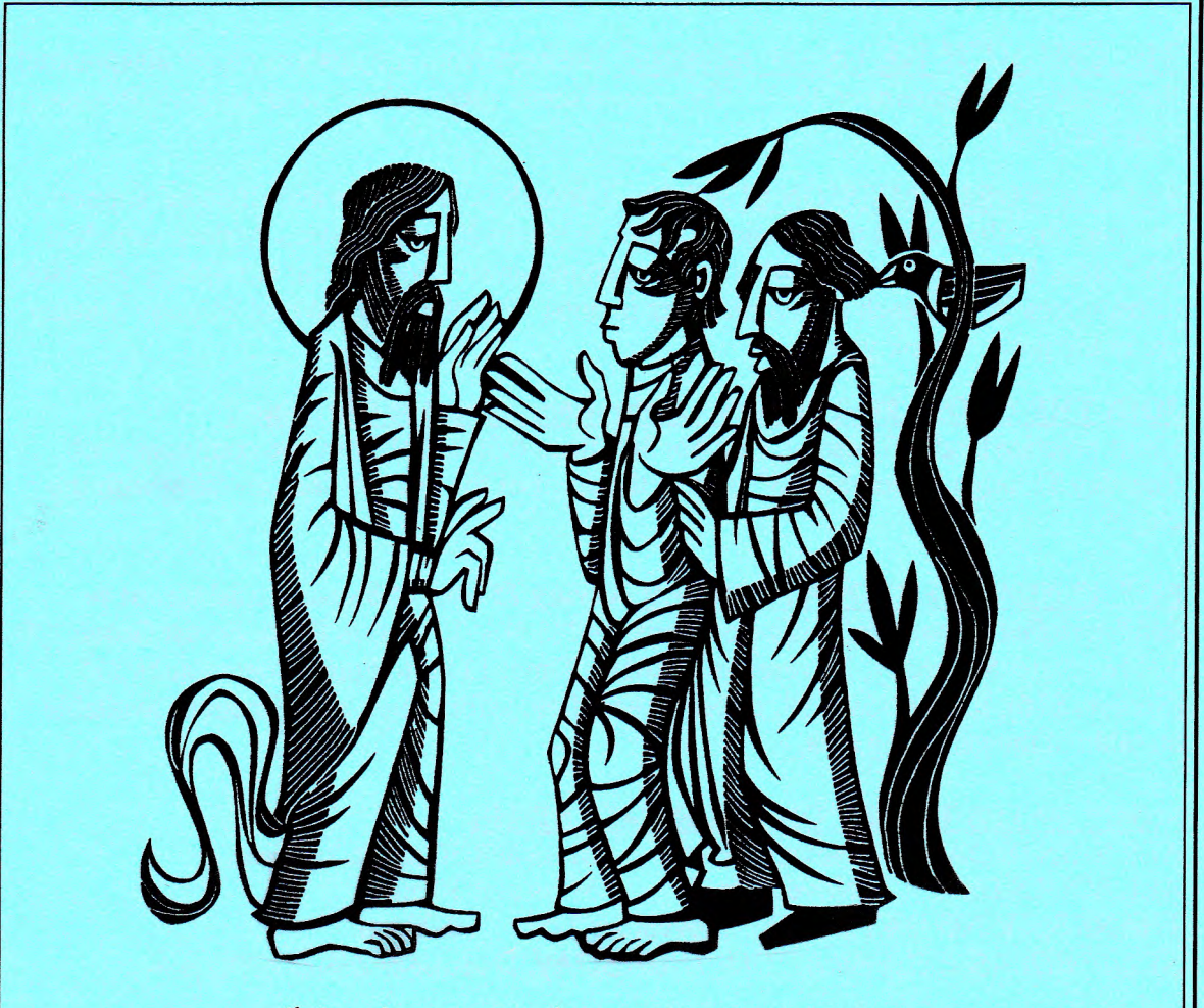
"You haven't been listening!"