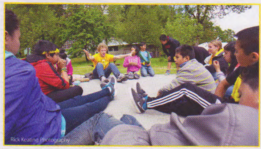
Youth and Youth Ministers engage in themed activities during a youth conference in Turner, OR.